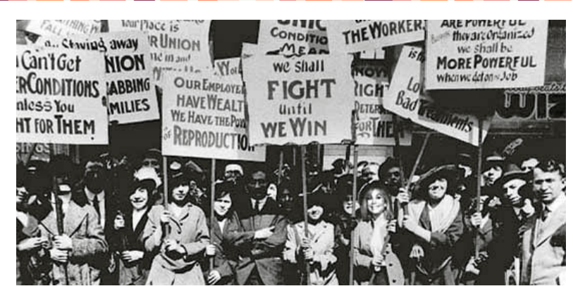
Women textile workers on strike in 1912, Lawrence, Mass http://policyfix1.files.wordpress.com/2014/03/breadandroses_0308.jpg

On the morning of March 25, 1911, 146 women workers were killed in a fire at the Triangle Shirtwaist Factory in New York. The doors to the factory were locked and firefighters' ladders could not reach the factory windows. Women burned to